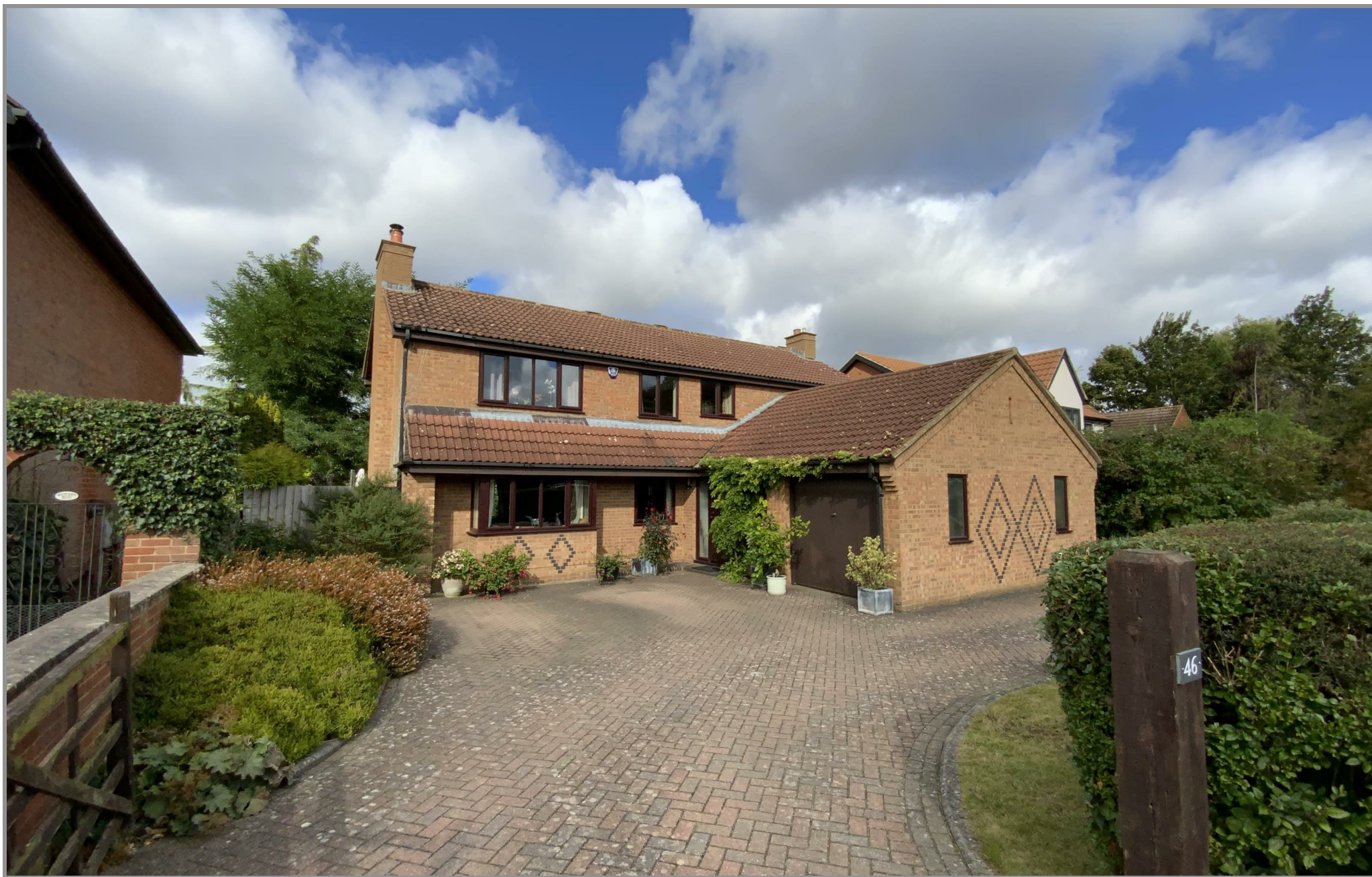
Tudor Gardens, Stony Stratford, MK11 1HX